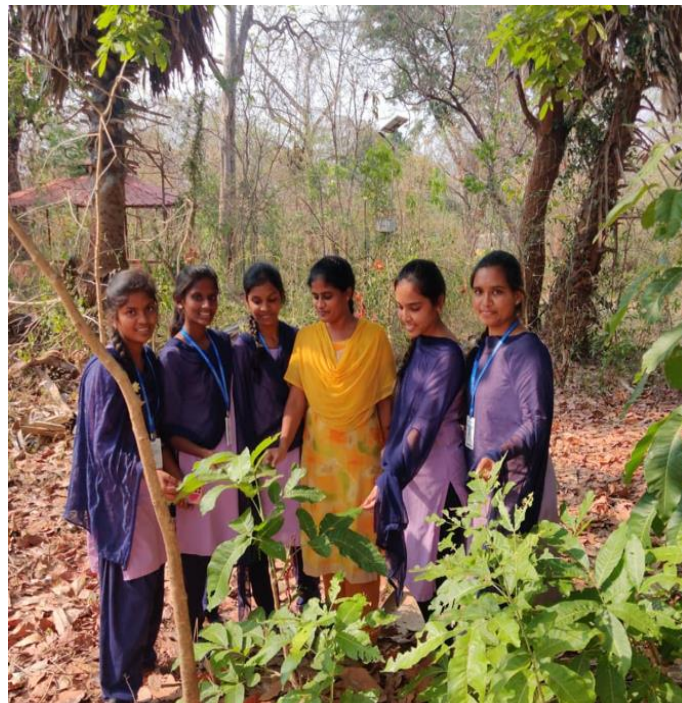
Field visit by students to know the medical plants