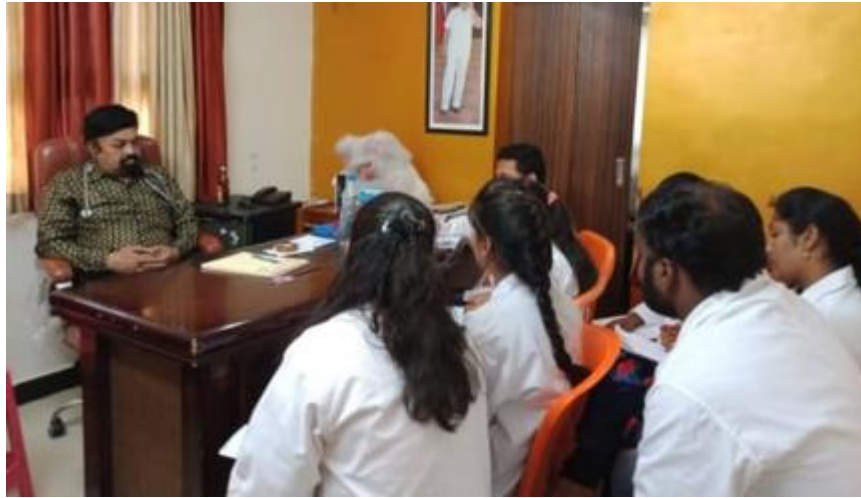
Students' discussion with doctor regarding clinical aspects.

(Approved by AICTE & PCI, New Delhi & affiliated to Kakatiya University, Warangal, T.S) NARSAMPET, Dist. Warangal - 506 332, (T.S)