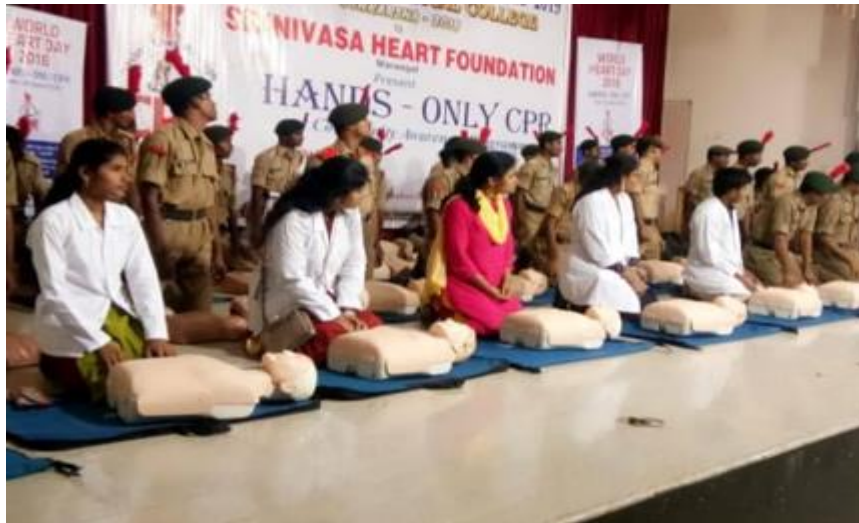
Students participated in hands only CPR training program

(Approved by AICTE & PCI, New Delhi & affiliated to Kakatiya University, Warangal, T.S) NARSAMPET, Dist. Warangal - 506 332, (T.S)