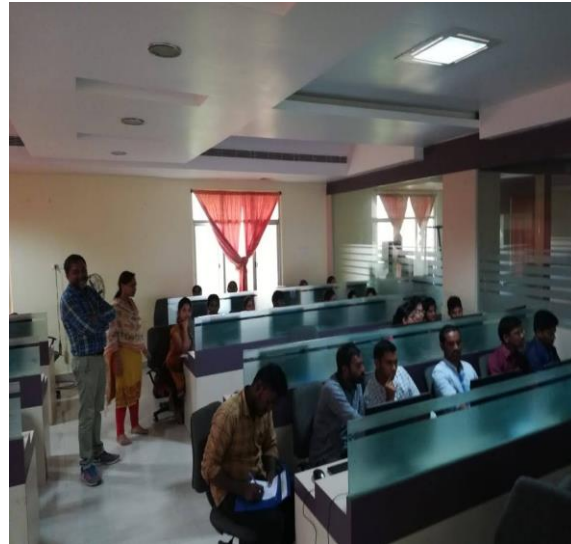
Work shop on SYSTAT software