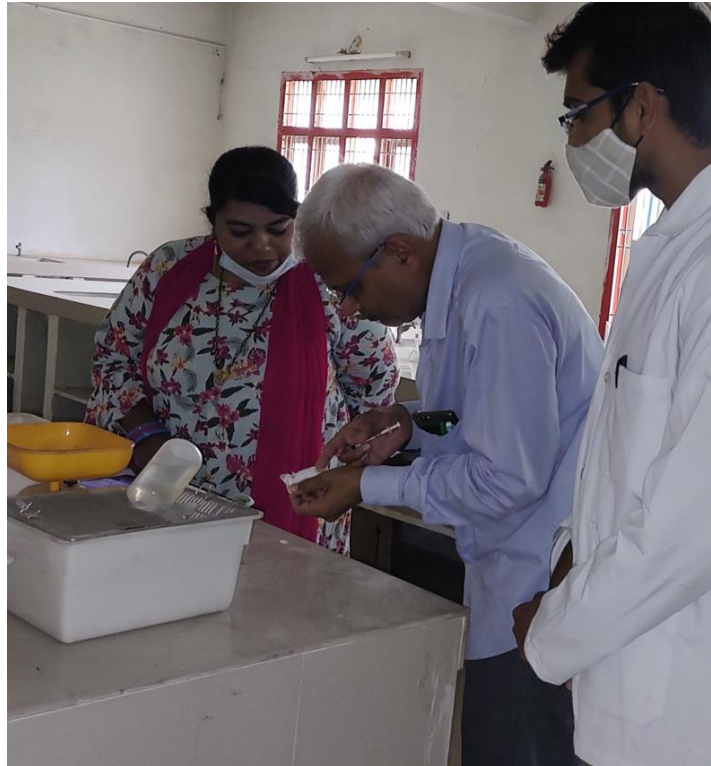
Student observing experiment on mice.

(Approved by AICTE & PCI, New Delhi & affiliated to Kakatiya University, Warangal, T.S) NARSAMPET, Dist. Warangal - 506 332, (T.S)