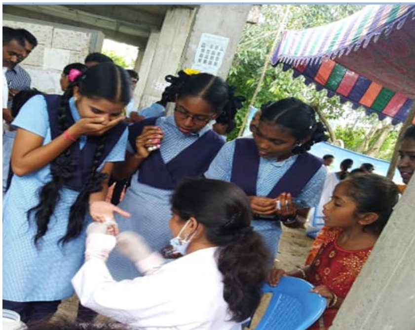
Student performing blood analysis for school students