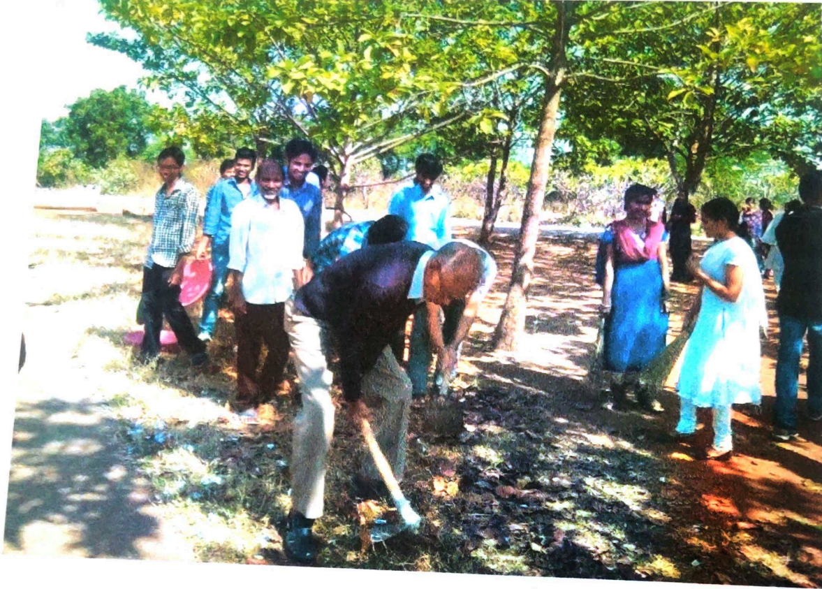
Principal Jayamukhi College of Pharmacy Narsampet-506 332

Staff and Students of Jayamukhi College of Pharmacy participated in "Swachh Bharat Abhiyan" to propagate the relationship between cleanliness and better health on 8th November, 2019. The transition of a cleaner India to a healthier India was the motto of this campaign