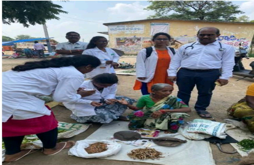
Students of Jcp monitoring blood glucose level in vegetable market in diabetic camp