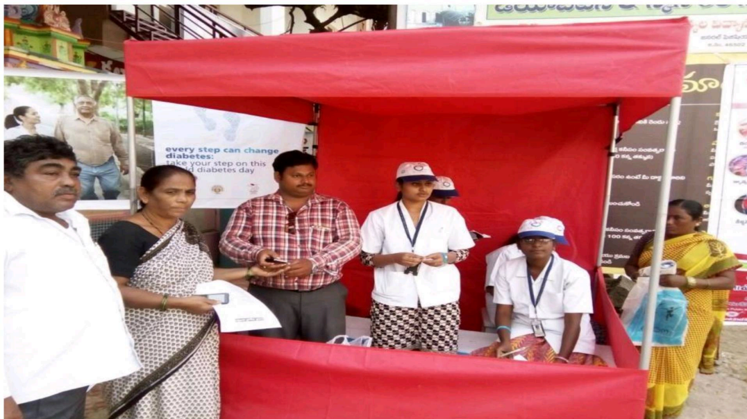
Students of Jcp monitoring blood glucose level during health checkup