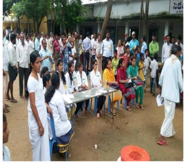
Students of Jcp in patient counseling during health checkup