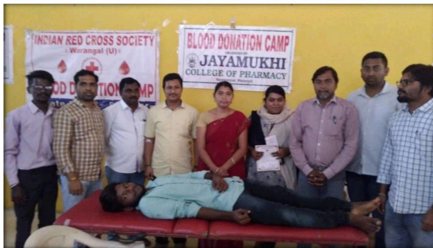
Students of Jcp donating blood in blood donation camp