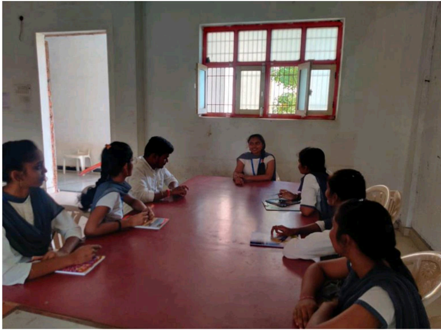
Students of Jcp participating in group discussions