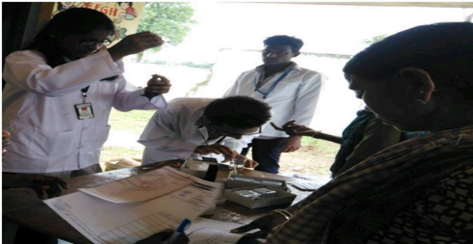
Students of Jcp checking hemoglobin in patients during health checkup