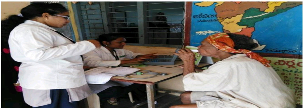
Students of Jcp performing pulmonary test in patients during health checkup