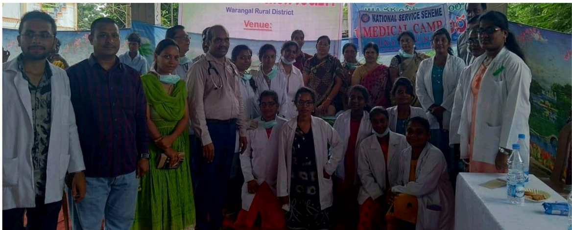
Students participating in medical camp conducted by NSS