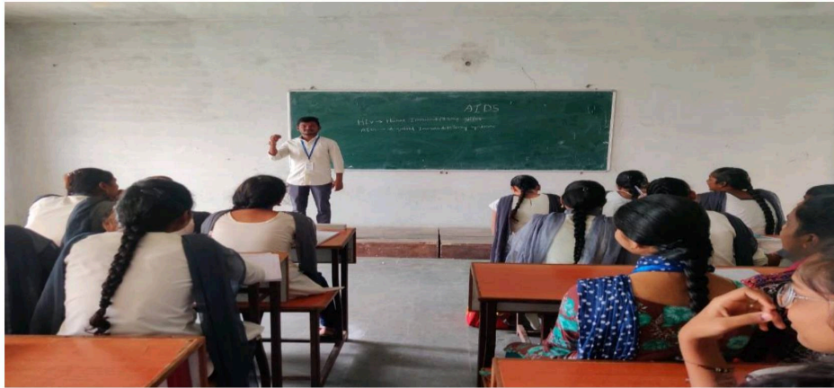
Students of Jcp presenting seminars