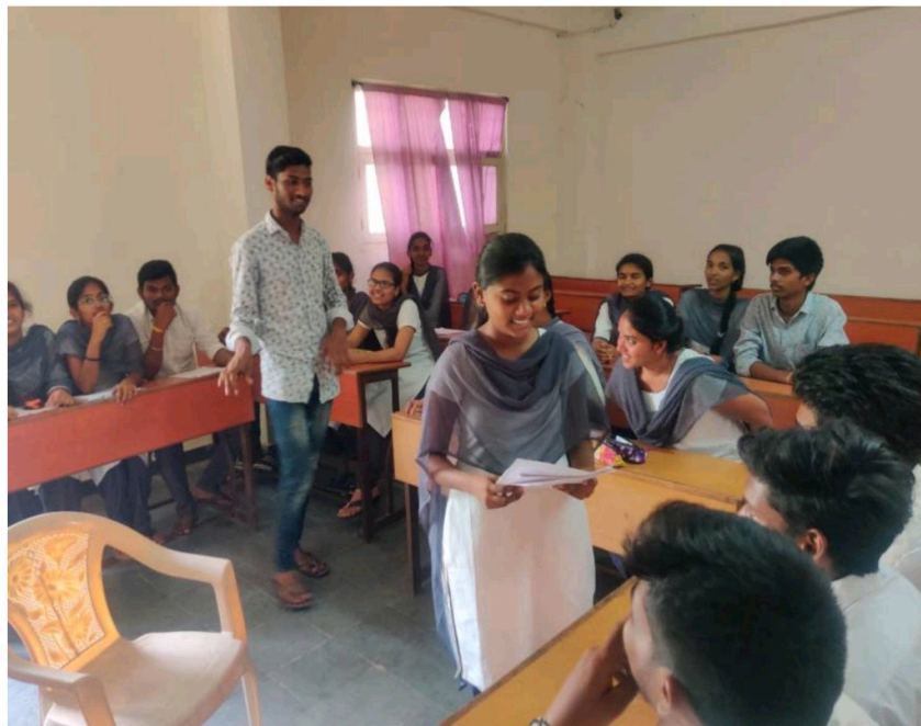
Students of Jcp participating in group discussions