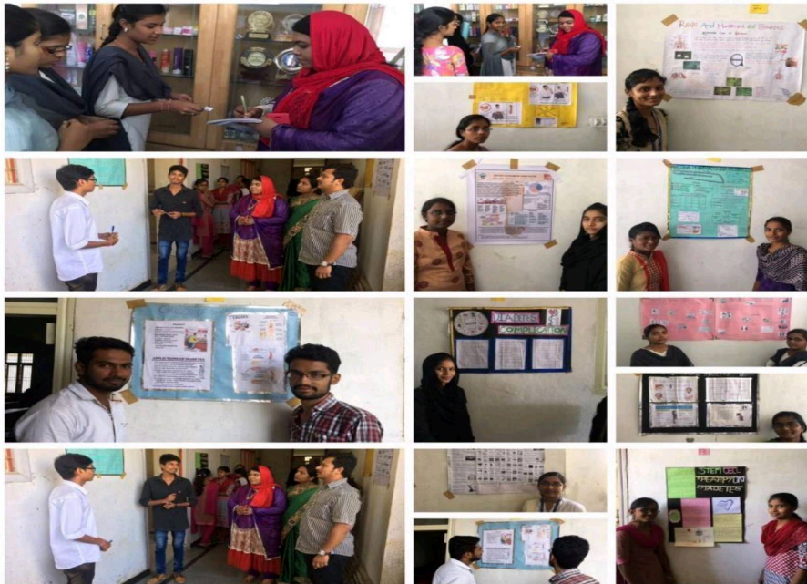
Students of Jcp in poster presentations