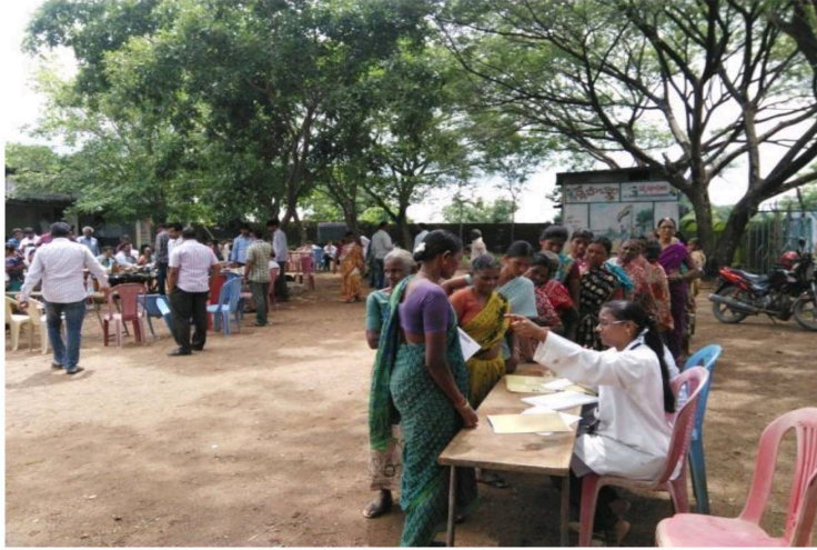
Students of Jcp enrolling patients for health checkup