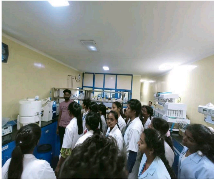
Students of Jcp in industrial visits