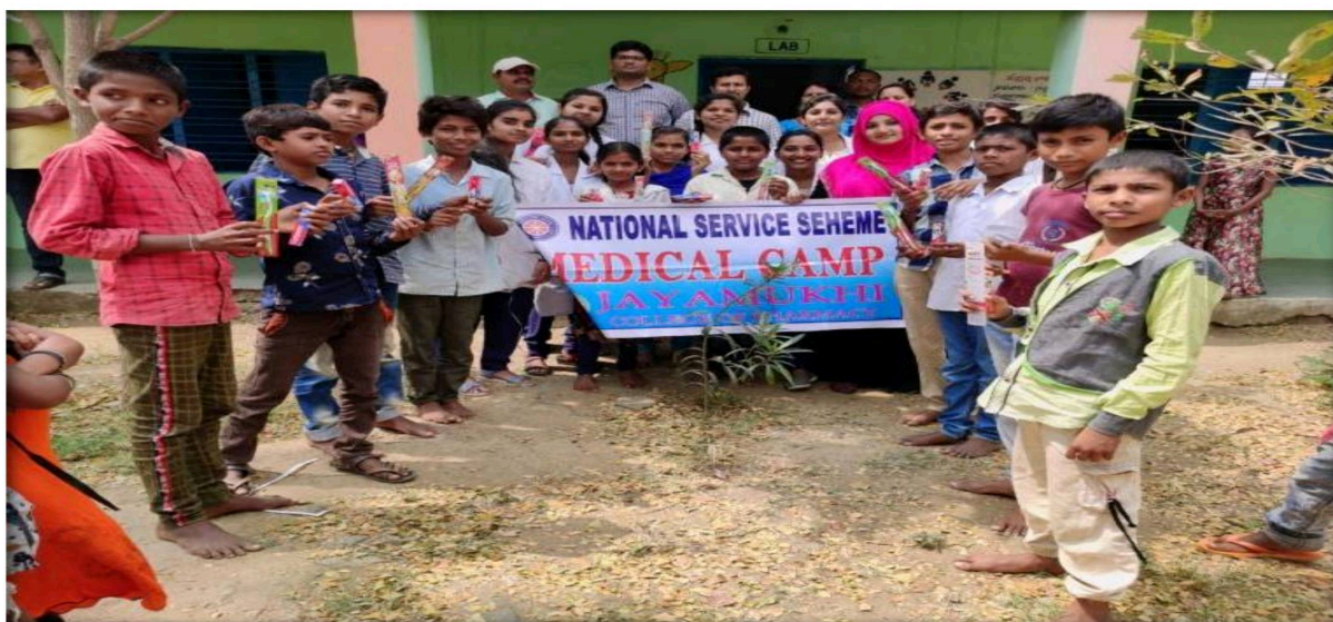
Students of Jcp participating in dental camp conducted by NSS distributing tooth brushes