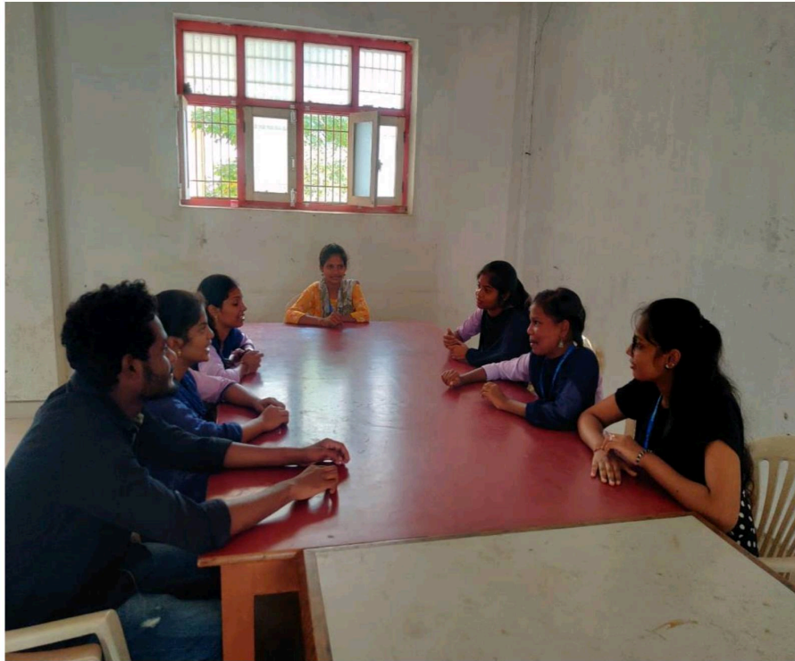
Students of Jcp participating in group discussions