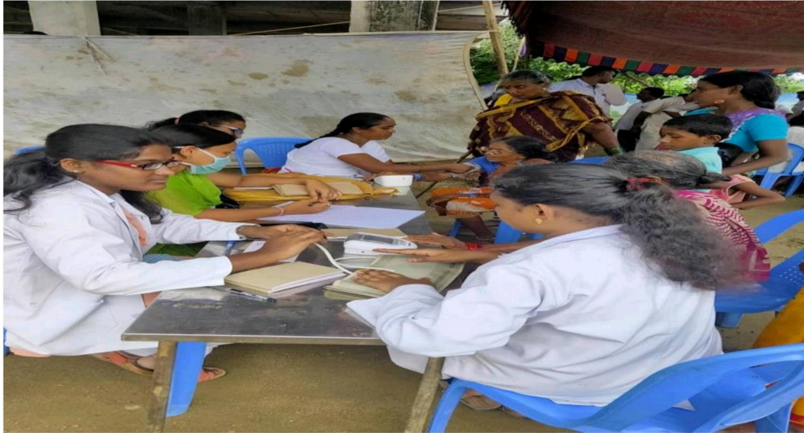
Students of Jcp monitoring blood pressure to the patients of the medical camp